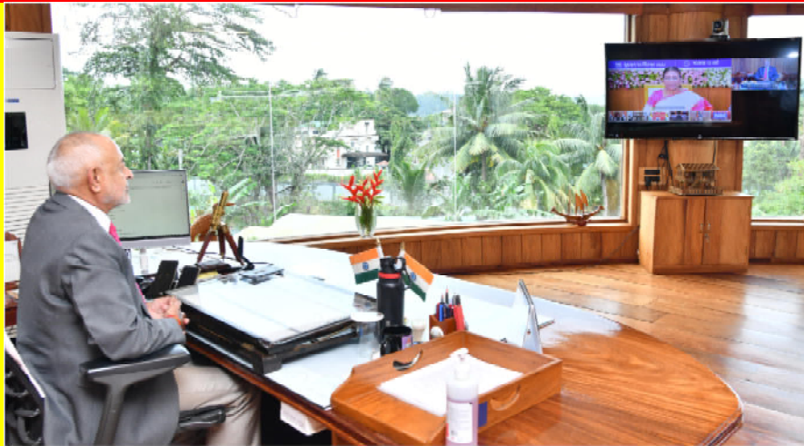
Admiral D K Joshi, PVSM, AVSM, YSM, NM, VSM (Retd.), Hon'ble Lt Governor, A&N Islands and Vice-Chairman, Islands Development Agency participated through Virtual mode in the launch of Ayushman Bhav campaign Chaired by Hon'ble President of India, Smt. Droupadi Murmu.

achieving such big goals. The President said that providing Ayushman cards to all the beneficiaries; organizing Ayushman meetings to make villagers aware about health, hygiene and nutrition; organising Ayushman Melas; and arranging visits of specialist doctors at the