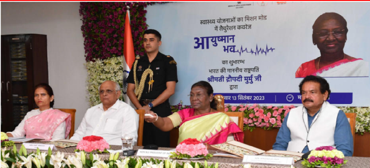
The President of India, Smt Droupadi Murmu virtually launching the Ayushman Bhav Campaign from Raj Bhavan, Gandhinagar on September 13, 2023.

The Hon'ble President of India, Smt Droupadi Murmu virtually launched the Ayushman Bhav Campaign from Raj Bhavan, Gandhinagar today. Speaking on the occasion, the President said, the goal of 'Ayushman Bhav Campaign - no person should be left behind and no village should be left behind - would make our country successful in achieving the objective of Universal Health Coverage. She added that if every person and every family stays healthy, then the resolve to build a healthy India would be fulfilled. She was happy to note that a Multi-Ministerial approach has been adopted to achieve this goal. She stated that everyone's cooperation would be helpful in